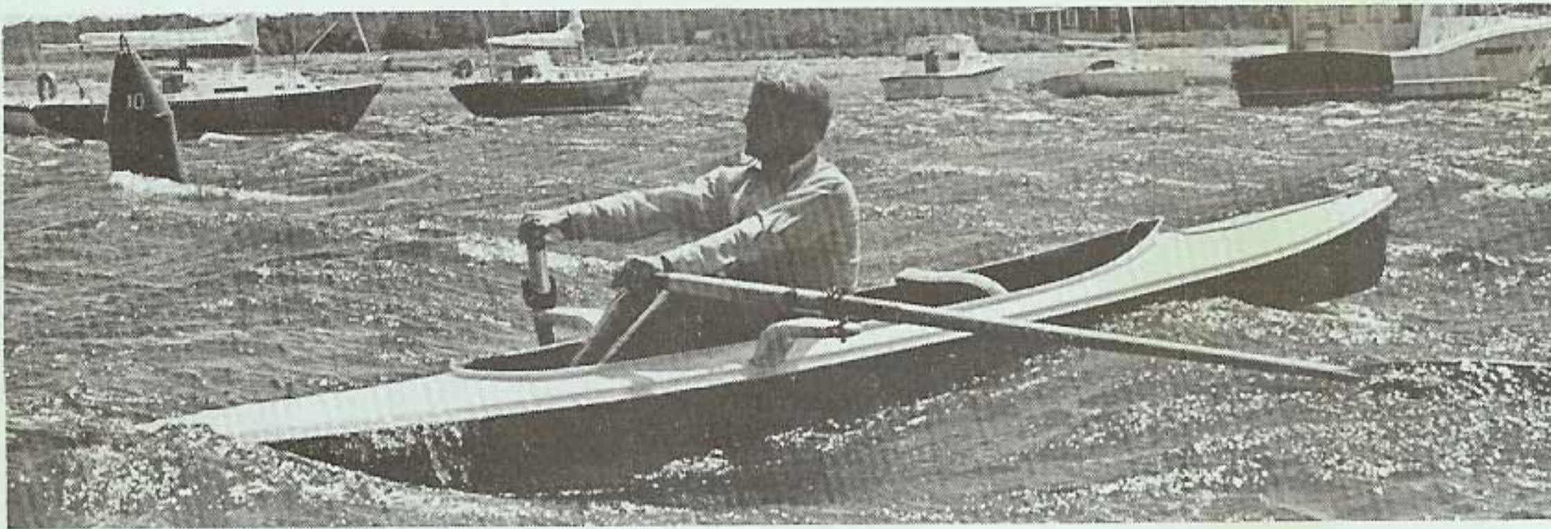
STANDARD MODEL SINGLE (shown in 62 mph winds of Tropical Storm Doria)

Designed by Naval Architect Arthur E. Martin, the Alden Ocean Shells enable anyone to enjoy the health benefits of rowing while at the same time experiencing the satisfaction of moving swiftly and quietly through the water. Fresh or salt, rough or smooth, as long as there is some kind of water within driving distance, you can take advantage of it. These boats may be carried on a car top, moored or pulled up on a beach.