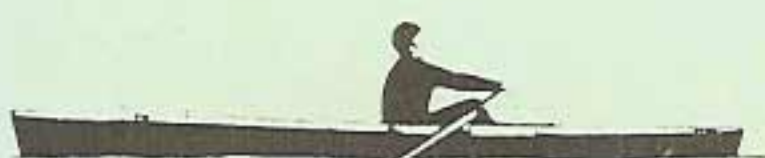
ALDEN OCEAN SHELL